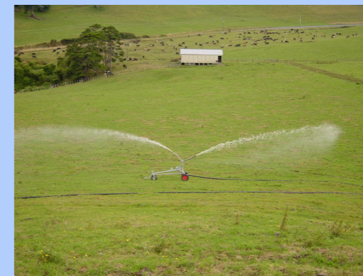
FIGURE 4: Pasture Irrigation Method

The regional council was initially hesitant to accept this loading rate as at first appearances the requested nitrogen loading rate was far higher than the conventional nitrogen limit in their regional plan. Following significant consultation with the council, the requested loading rate was accepted but with strict operational conditions to prevent nuisance and runoff.