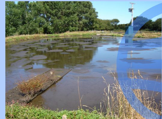
FIGURE 3: Accumulated Biosolids in the Wastewater Treatment Lagoon

While this will not quantify the exact conversion rate or organic nitrogen to PAN, it will help identify any affects on the receiving environment and potentially strengthen the basis for future biosolids applications.